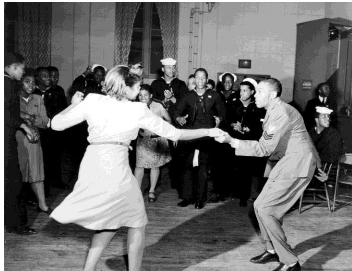
Dance Night at the Smith Street USO – 1942