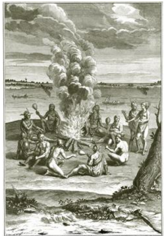
Les VIRGINIENS autour du FEU: ils se rassemblent après avoir été défaits de quelques jours (1680/81). Native Virginians Gathered Around Fire – Abt. 1587