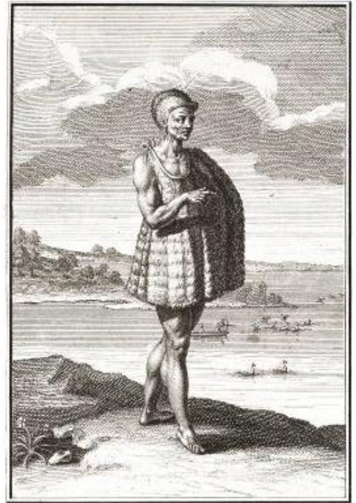
PRÉTRE de la VIRGINIE vu du côté droit.